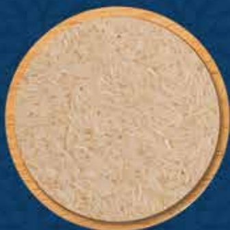
PK 386 Steam