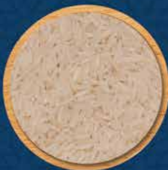
PK 386 White